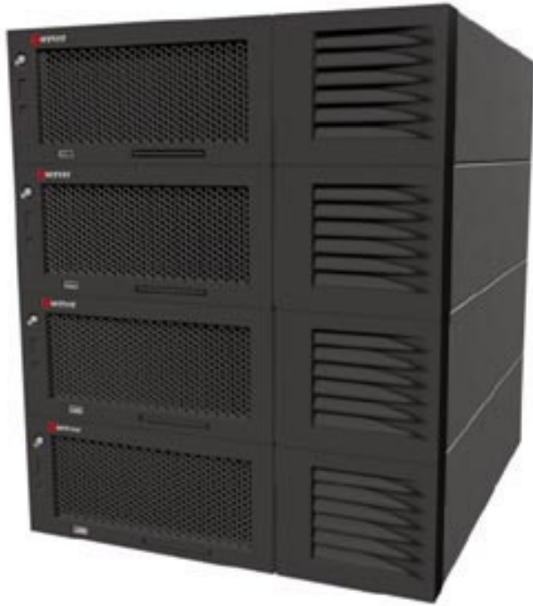
XpandOnDemand scalability allows you to grow your 4-way server to a 16-way server.

When you're ready to scale from a 4-way to an 8-way, for example, you won't have to buy a whole new system. Instead, you can protect your initial investment by simply adding another 4-way expansion module. The modules are connected via high-speed scalability ports. These ports make investment in adapters and switches no longer necessary—for even greater cost savings—and