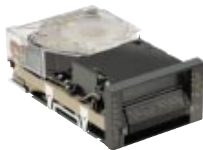
35/70GB DLT Internal Tape Drive 3