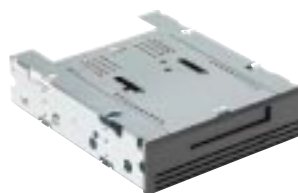
12/24GB 4mm DAT Internal Tape Drive