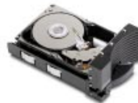
18.2GB 10,000rpm Wide Ultra SCSI Hard Disk Drive

It's all about your business data. Data your end users need to keep you up and running. To keep you on a par with your competition. To help you surpass them. Your reliance on hard disk drive storage is why we test every one of our drives for system compatibility, component reliability, optimum performance and data integrity. All of which underscores our commitment to deliver the highest performing, most reliable hard disk drives available to you regardless of where in the world you do business.