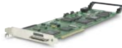
ServeRAID-3H and -3L Ultra2 SCSI Adapters

It's a sad fact that the contemporary business landscape is littered with the remnants of companies that left their key assets unprotected. Because your business-critical applications and data are the key resources around which your enterprise revolves, they must be protected. Utilizing a Redundant Array of Independent Disks (RAID) adapter is an excellent storage solution for businesses of all sizes to ensure the high availability and protection of these assets. The recently introduced third-generation of the IBM ServeRAID-3 family offers exciting new possibilities for expanding your RAID capabilities.