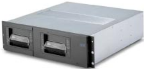
NetMEDIA Storage Expansion Unit EL with two DLT Tape Drives

Additionally, the flexible NetMEDIA Systems Management Adapter provides the added benefit of an Ultra-2 SCSI channel (also known as low voltage differential SCSI or LVDS) that handles both Ultra2 and earlier generation SCSI devices. Plus, the onboard electronic self-termination function lets you power off the NetMEDIA unit without disrupting the controlling server.