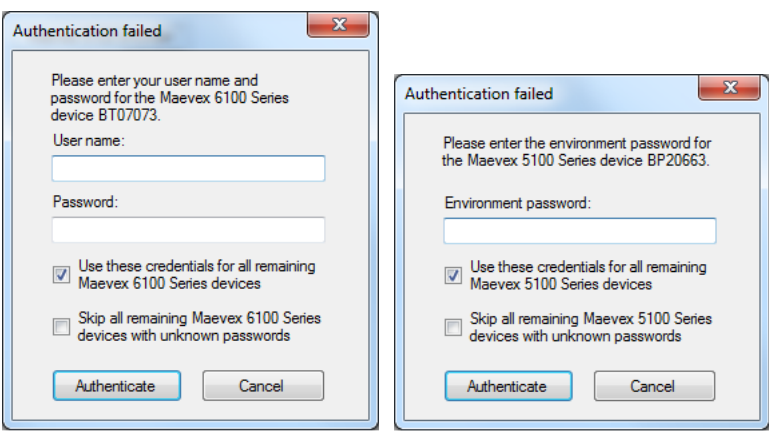
Maevex 6100 Series device authentication

If you provided a password for your Maevex devices, you may be prompted to authenticate the devices found. If you're prompted, depending on the device type, enter your User name and Password or the Environment password for the Maevex devices found.