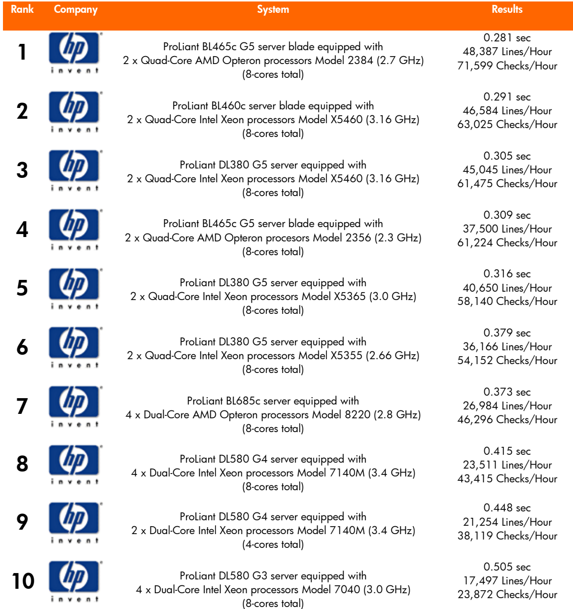
Table 2. HP ProLiant servers hold the Top 10 positions for Oracle E-Business Suite performance utilizing the small-model benchmark workload of 1,000 online users with batch components of 10,000 order lines and 5,000 payroll employees.

With the ProLiant BL465c G5 as the top performer, HP now captures the Top 10 positions for published Oracle E-Business Suite small model benchmarks.