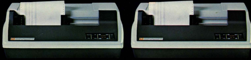
Model 810 Impact Printers.