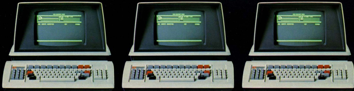
Model 911 Video Display Terminals, and Keyboards.