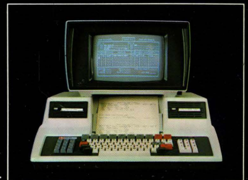
Model 770 Intelligent Terminal.

The 774 follows the Model 770, a completely packaged intelligent terminal system. All family members speak the same high-level language.