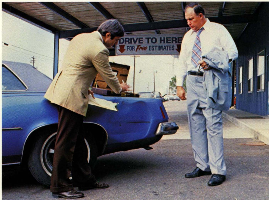
... can speed up insurance claims

TPL FORMS — TPL 700 requires minimal programming experience. Screen formats for data entry are easy to generate by means of TPL 700 Forms, which employs an operator-oriented "menu" concept for program development, and allows more editing and computation than any similar package available today. Key features from the "menu" include character and field validation using fixed or user-defined range sets, table lookup, substitution and cross-field validation, as well as business arithmetic operations, conditional branching and support for multipage forms.