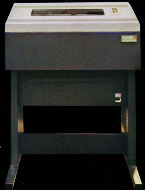
Model 2230 Line Printer.