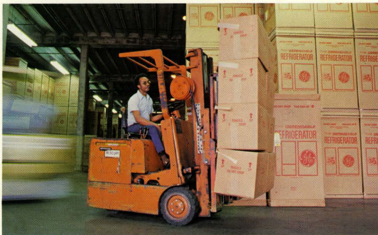
The 774 can improve inventory control...

This removes a substantial burden from your host, reduces your