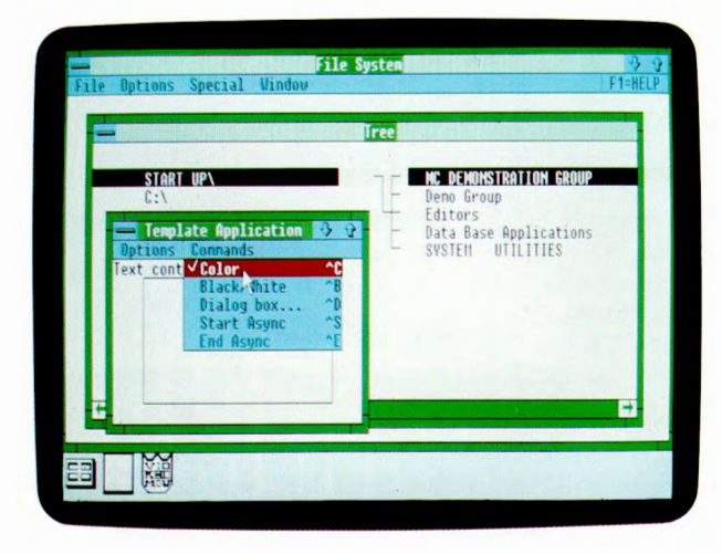
The OS/2 Presentation Manager feature simplifies and improves the way you interact with your system.

SQL application programming interface—for high-level data definition and manipulation in data base applications